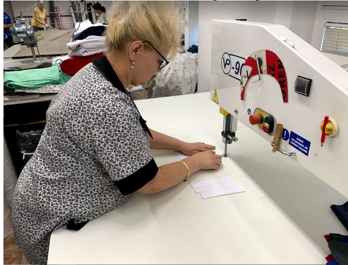
Figure 4: Fabric cut according to design cut