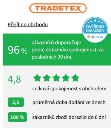
Figure 1: Customer evaluation

Evaluation of the e-shop on the Heureka.cz portal: 96% of customers recommend it according to the TRADETEX satisfaction questionnaire for the last 90 days. Overall satisfaction with the store is 4.8 (out of a maximum of 5). The average delivery time ranges from 2-3 days, 100% of customers received the goods within 6 days at the latest.