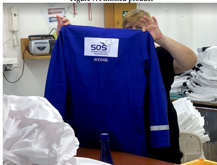
Figure 7: Finished product