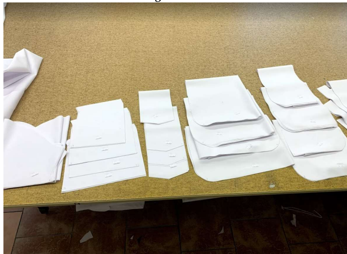
Figure 5: Cut