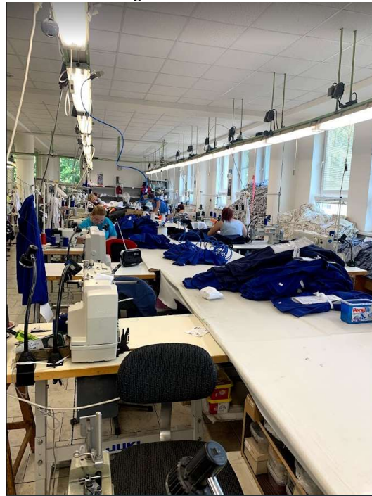
Figure 6: Production