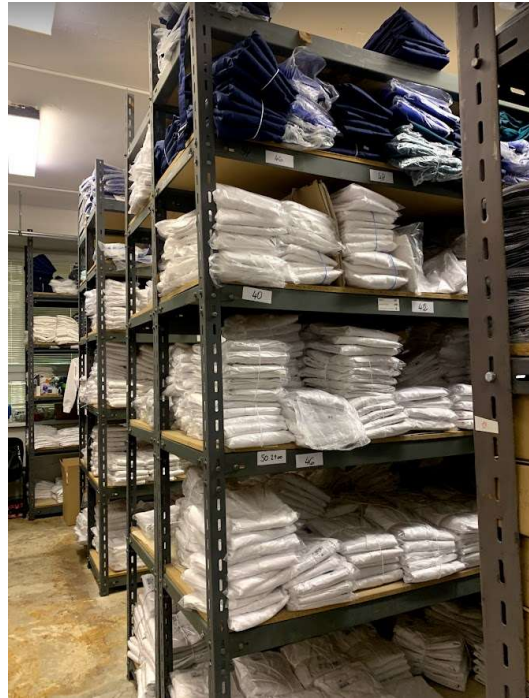
Figure 8: Storage